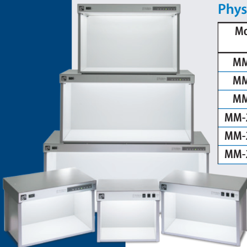
From top down: MM-2436e, MM-2448e, MM-2460e Bottom row left to right: MM-4e, MM-2e, MM-1e

GTI is a leading manufacturer of tight tolerance lighting systems for critical color viewing, color communication, and color matching. An in-house spectroradiometric laboratory and a 100% measurement and verification production process guarantees that precision and accuracy is built into all products. All products are shipped with a certificate of product conformance (NIST traceable).